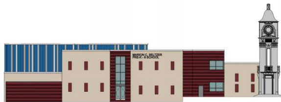
2 A3 NORTH ELEVATION - COLOR SCALE: 1/16" = 1'-0"